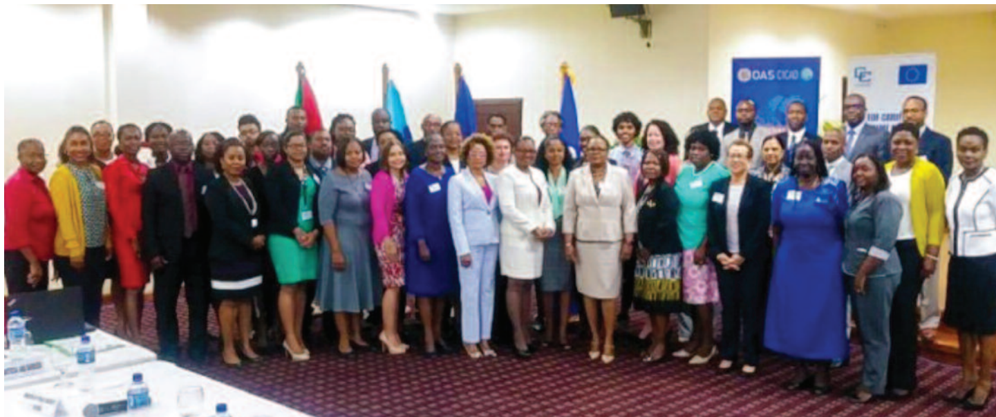
Participants at the Regional Seminar for National Drug Observatories in the Caribbean in Georgetown, Guyana, April 4 to 5, 2018.

The Inter-American Drug Abuse Control Commission (CICAD), in collaboration with the Caribbean Community (CARICOM), hosted a Regional Seminar for National Drug Observatories in the Caribbean in Georgetown, Guyana, April 4 to 5, 2018.