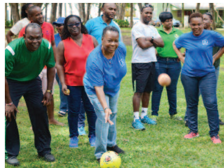
All eyes on the ball!

Needless to say a good time was had by all!!!