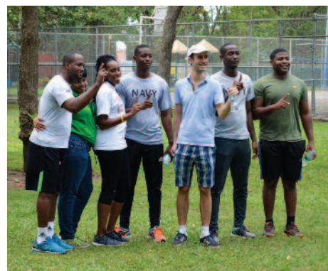
The Winners Circle!