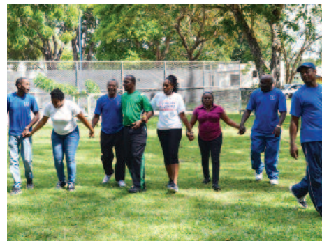
NCSA staff and invited guests participating in a team building exercise.