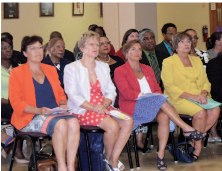
A cross-section of the audience attending the Drug Treatment Court graduation ceremony.

The Barbados Drug Treatment Court (DTC) held a graduation ceremony for its second cohort of clients on Wednesday, 13th December 2017, at the Supreme Court of Barbados. Twelve clients (eleven males and one female) received Certificates of Completion. These certificates represent the completion of a rigorous programme of court-supervised treatment and rehabilitation work to help them to regain control of their lives. These clients, as an incentive, will have the offence that brought them into the DTC removed from their record.