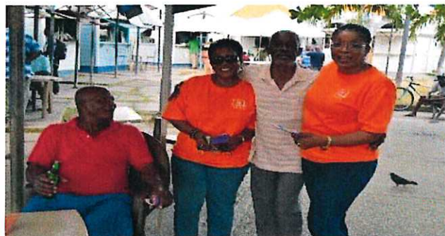
Interaction 11 th January 2019 @ Princess Alice Terminal