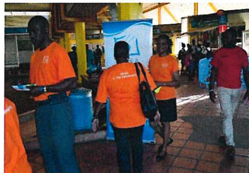
Interaction 18 th January 2019 @ Speightstown Terminal