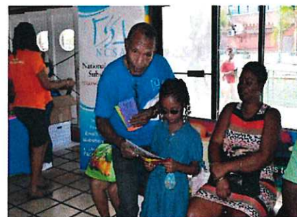
Interaction 4 th January 2019 @ Fairchild Street Terminal