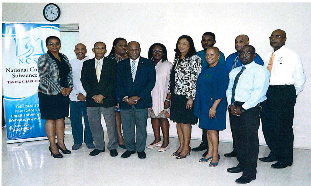
Hon. Edmund Hinkson, MP, Minister of Home Affairs and Directors of the National Council on Substance Abuse