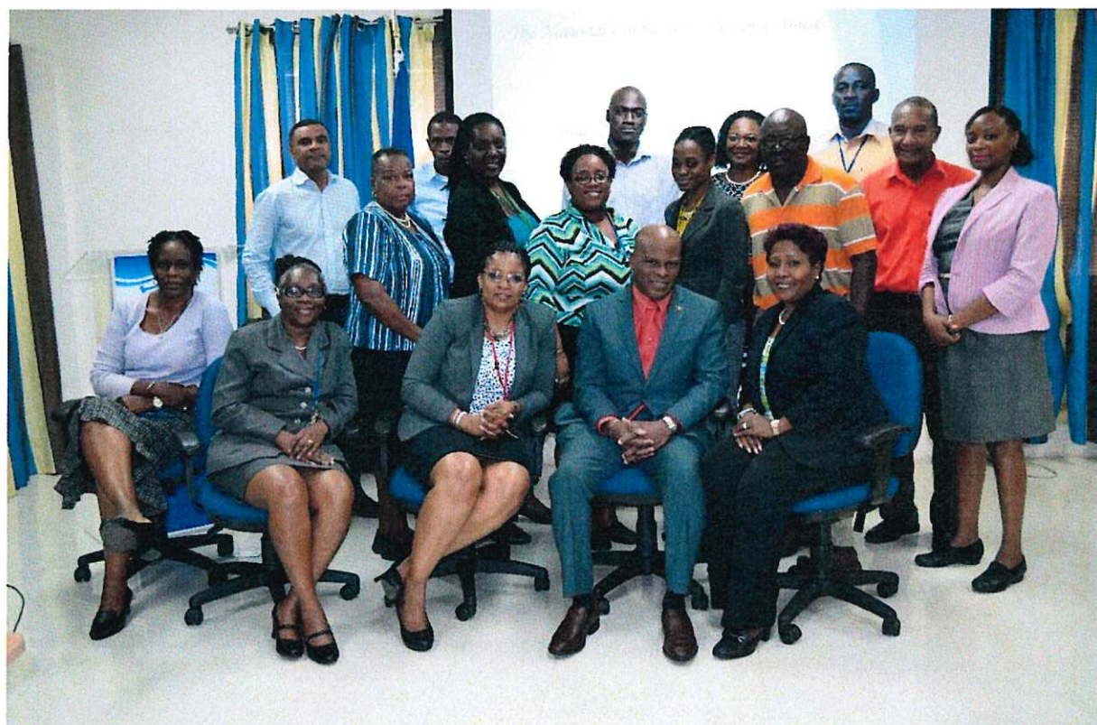
Hon. Edmund Hinkson, MP, Minister of Home Affairs and Staff of the National Council on Substance Abuse