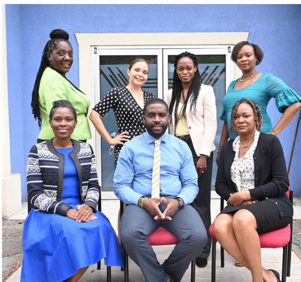
Programme Officers who attended the training

This training will also add value as the Council seeks to maximise on this new approach to programme delivery.